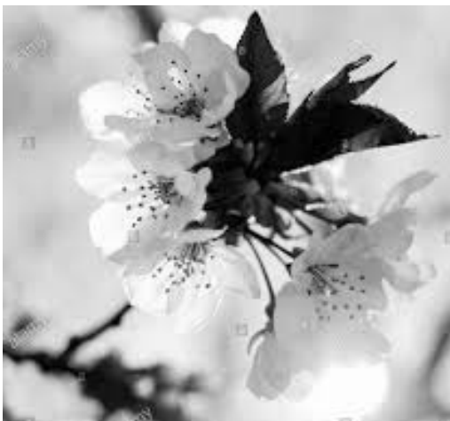
Black and White